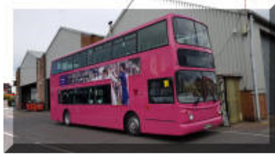
32004 in pink.

32004/8 have appeared in all over pink same style as the Streetlites so maybe another M Ticket advert.