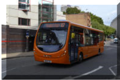
Weston Streetlite 47552 is the first one painted into Orange for Excel routes still minus its branding.