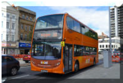
33829 latest repaint into Excel livery.

33413, 33508 & 33829 are now Excel Orange. 33414 also now Orange. The first Streetlite into orange is 47552.