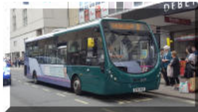
47436 with new GWR styled green front for route 8.

47435-7 are the first Streetlites to appear with dark green front for route 8.