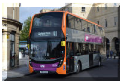
36804 in Bath on route U1.