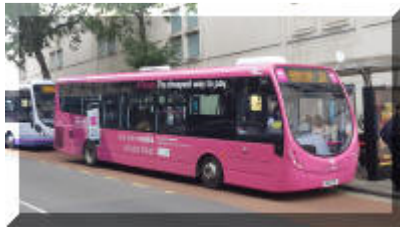
M-Ticket advert 47555