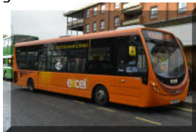
All 3 orange Streetlites at Weston are now Excel Branded as shown by 47552.

33828 is another Enviro now Orange. 33506/566/71 are also now in Orange. 33550 also done. 33416 & 33827 are now Orange as well.