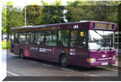
42897 in UNI bus livery.