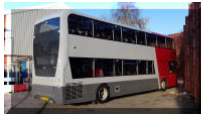
1st to arrive 33491 in the new Unibus livery.

2 more B7s from Glasgow have arrived here and 2 more Streetlites have gone the other way.