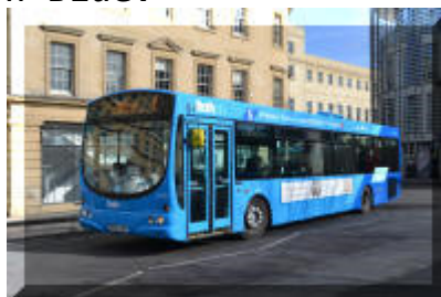
66881 showing the new colour for Bath City buses. Iso branded for route 5.

66881 at Bath is now in a new 2 tone blue livery and branded for route 5 if its successful it could be rolled out on the Bath City fleet. 53820 and 66882/3/4 are also now Blue 66722 and 66884 are also in BLue.