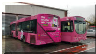
66992/3 are now under conversion to Training buses