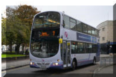
32545 now at work in Weston.

Another Scania in Bath is YT67XJZ so the Metro bus liveried ones are now