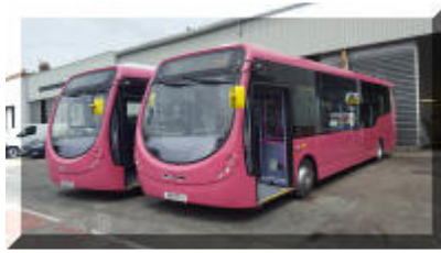
47555 & 47556 before their trip to London.