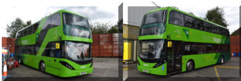
Scania Bio gas bus 39401.

Other new vehicles due soon are 24 Scania / Enviro MMC,S (not City,s) for UWE & Metrobus routes. Also on order are 12 Scania/ Enviro Citys for Hengrove (Airport A1) & 3 Enviro 200 MMC,s for Weston (Airport A3)