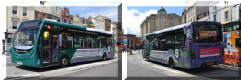
47435 branded for route 8 and showing the animals as well.

Most if not all the green ones 47435-41 now have the route branding applied.