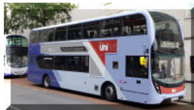
36810 new for the U1.

And the first Metrobus liveried ones have arrived and gone to Bath for UNI routes until Metrobus opens.