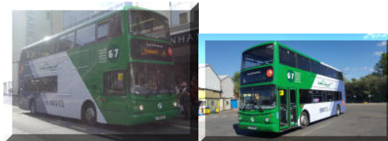
Bit of rushed shot of 32253 & 32257 in green for routes 6 & 7.

32253/7 & 32278 now are in Urban 2 with green fronts for routes 6/7. 32256 is also repainted but not lettered yet. 32258 is also now green and repainted.