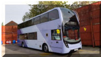
Just arrived 36820.