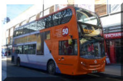
33662 now branded for route 50

All 3 original X7 buses 32685 Front and 32684 rear both going to Yorkshire and 32688 middle staying in Bristol The ex Devon Enviro,s are now getting their 50 branding applied.