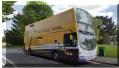
37339 with Wild Place advert.

66327 didnt stay barbie for long its now got another Heart advert applied.