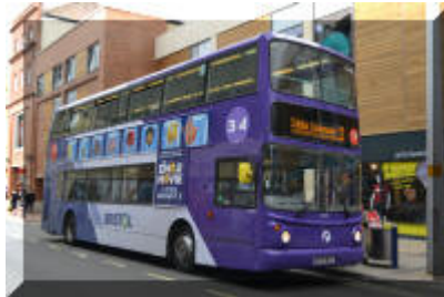
32090 with another coloured front.

32073 is the final bus to go green front.