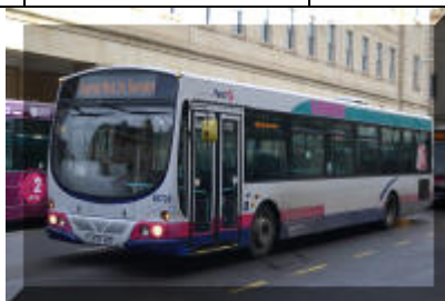
65724 currently on loan in Bath

The first of the ex Yorkshire B7s has arrived. With the following ex Bradford buses now in Bath.