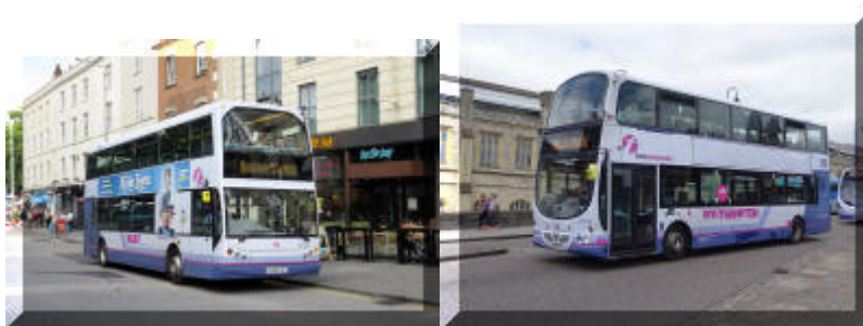
32763 and 37164 on loan. (Thanks Allan & Graham)

The first of around 10 Enviro 400,s coming from Oldham have arrived at Hengrove 33685/750/4 are here.