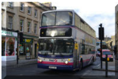
30857 in Bath.