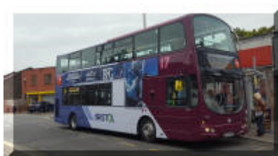
37007 branded for route 17.

37007/11-4 are now branded for route 17.