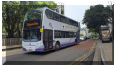
33685 now in Bristol

2 Streetlites from Manchester have arrived at Bath 63109/10 SM13NCU/V are here. Looks like they didnt like Bath and have gone straight into service at Hengrove first.