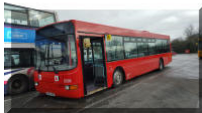
The new look for the Training Fleet 62198 is the first B10BLE converted.

Still outstanding from last years vehicle order is the 2nd Electric Enviro 39192 which is still at ADL having some modifications done once it arrives 39191 will then go back for the same mods so its looking like late March before these enter service. The 3 similar vehicles in London have hardly been used in service either.