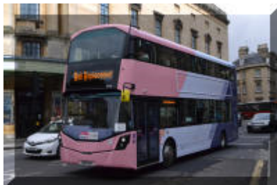
Eastern Counties have also sent 3 buses 35193/4/6 this is 35196 at work in Bath.