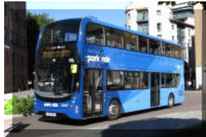
33937 showing the Blue livery. (Thanks Allan)

33931-6 are green 33937-41 are blue 33942 is GREY as a spare bus.