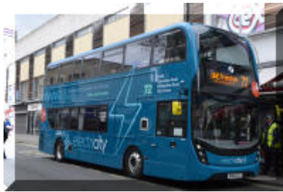
39192 in town