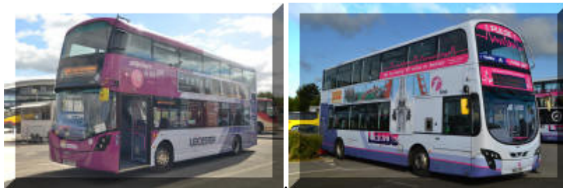
Leicester 35192 and Leeds 36191 at Parkway Station.

seven B9/Gemini IIs are being transferred from Leeds to Norwich but have stopped in Bristol for the 6 week rail replacement contract between Bristol and Newport 36191-7 are here along with 3 Streetdecks from Leicester 35188/91/2.