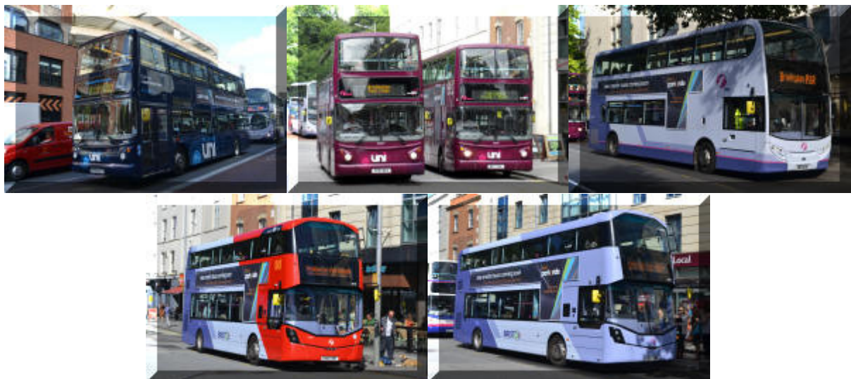
The many colours of Bristol Park & Ride at the moment.

In the meantime Hengrove are using B7s 32007/14/5/69/75/83 from Bath and 33685/750/4 and 35148-50 on Park & Ride routes until the new buses arrive.