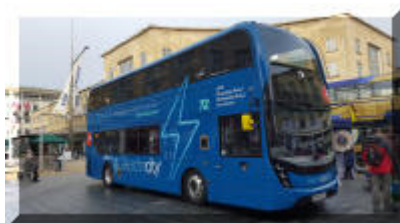
Virtual Electric 39191.

Another 3 vehicles have arrived on load at Bath they are Former Berkshire Scania,s 65724-6 which have recently been on loan at Weymouth.