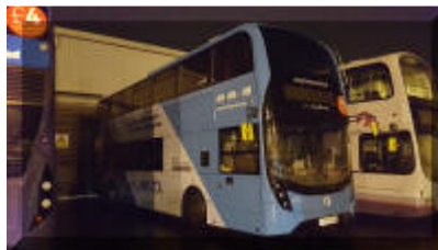
new into service 33793.

The 3 Enviro,s for the Severn Express have now arrived as 33488-90 YX66WGO/P/U and are Blue/Grey.