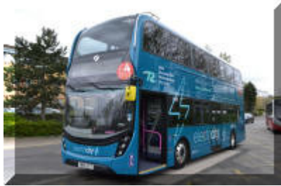
39192 parked on the charging plate at UWE.

Streetdeck 35115/6 have been re-branded from 70/1 and is now branded for the 72 presume these will act as a spare bus to cover for the Electric Enviro,s