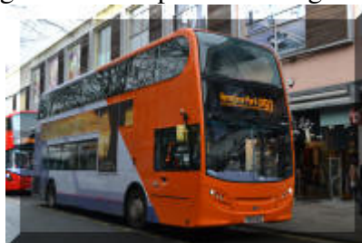
33665 is first into service on route 50.

The 9 Enviro,s from Cornwall are having their fronts painted Orange ready to go onto route 50.