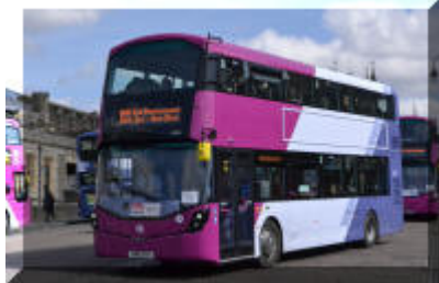
Leicester 35181 on Rail Replacement work.

15 New Streedecks from Leicester have arrived on loan at Bath for the Rail replacement service between Bristol and Bath from 2nd-10th April 35168-82 are expected to be used.