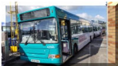
42966 in Green for route 5.

42966/9 have received green fronts for route 5.