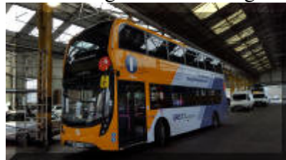
Route 1 branded 33965.

Some of the Orange fronted buses are now receiving route branding Enviro,s for the 1 and Gemini,s for 2.