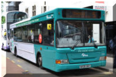
42964 Branded for the Mint Route 5

42964/5 now have a green front for route 5. The Darts on the 5 are now branded the route is marketed as The Mint Route