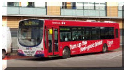
66327 with Heart Advert.

37341 has now lost its Strongbow advert. 66173 is now Red and 66207 is in next.