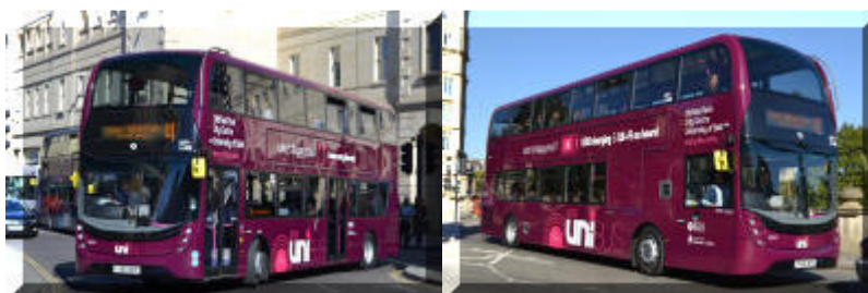
All 8 are now at work in Bath as shown by 33944 & 33950

In Bristol 33952/3 have had their double rear tyres replaced with a new trial single tyre hopefully this will reduce tyre costs if its successful.