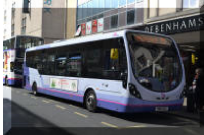
just arrived from Manchester 63110.

2 Streetlites from Manchester have arrived at Bath 63109/10 SM13NCU/V are here. Looks like they didnt like Bath and have gone straight into service at Hengrove first.