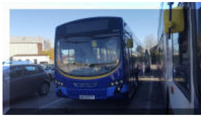
69445 from Urban to Mendip Explorer.