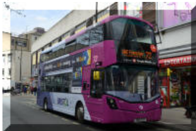
35115 re-branded for the 72 and also carrying the new style of fleetname for the Bristol area once the 2015 lettering has been removed.

Streetdeck 35115/6 have been re-branded from 70/1 and is now branded for the 72 presume these will act as a spare bus to cover for the Electric Enviro,s