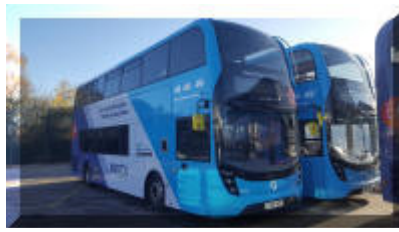
Ready for the road 33928.