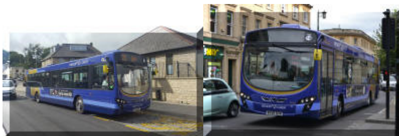
69457 first B7RLE in Mendip Explorer livery in service since joined by 69458..

Wells B7RLE,s are going into Mendip Explorer livery 69457/8 are the first one,s painted . 69448 is also Blue.