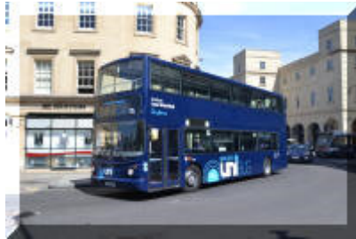
32075 in Blue UNI bus livery.